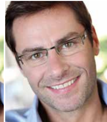
KODAK CleAR+ Lens