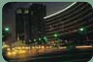
KODAK CleAR Lenses

Eliminates Irritating Glare – Reduces eyestrain and fatigue from artificial lighting and computer screens.