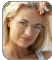
KODAK Clean'N'Clear Lenses