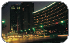
KODAK Clean'N'Clear Lenses