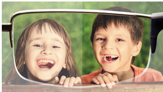
KODAK Clean&CleAR Lens

With an untreated lens, approximately 10% of light is reflected away from the eyes, which makes it difficult to see clearly.