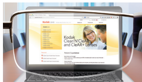
Regular Lens KODAK Clean&CleAR Lens

Reduces eye strain and fatigue caused by glare from artificial lighting, tablets and computer screens.