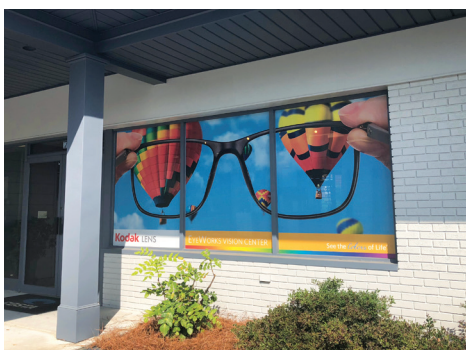
KODAK Lens-branded window "cling"