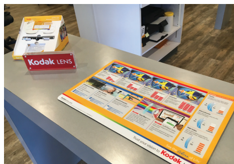
KODAK Lens merchandising kit