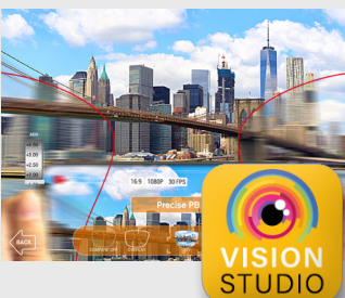
NEW Vision Studio App