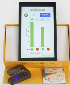
NEW KODAK Lens Blue Light Measuring Unit