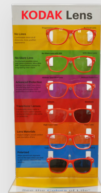
KODAK Lens Education Center