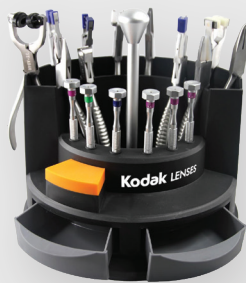
KODAK Lens Tool Kit