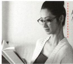
Natural Ergonomic Posture