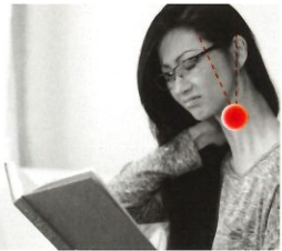
Improper Posture Causing Discomfort