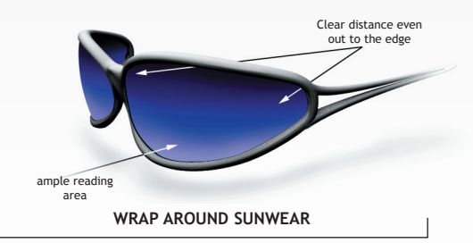
NuPolar is available in the steep front curves needed for wrap sunwear

IMAGE is available in Trilogy and 1.67 for high-end rimless